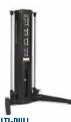
*MULTI-PULL ROTATION LOW #G626

PRODUCT DIMENSIONS 65 x 113 x 85 in (165.1 x 287 x 215 cm) WEIGHT STACK Two: 210 lbs (95.2 kg)