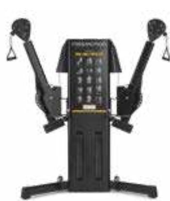
DUAL CABLE CROSS LITE #G424

PRODUCT DIMENSIONS 70 x 122 x 92 in (177.8 x 309.8 x 233.6 cm) WEIGHT STACK Two: 240 lbs (108.8 kg) Stacks