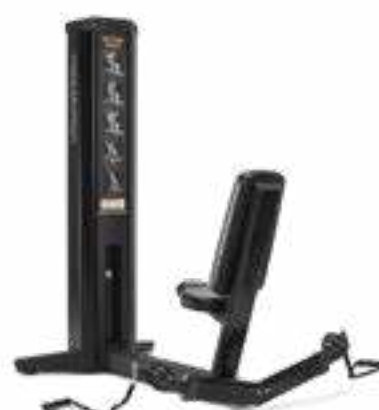
MULTI-PLANE SHOULDER #G601

PRODUCT DIMENSIONS 69 x 53 x 73 in (175.2 x 134.6 x 185.4 cm) WEIGHT STACK 200 lbs (90 kg)