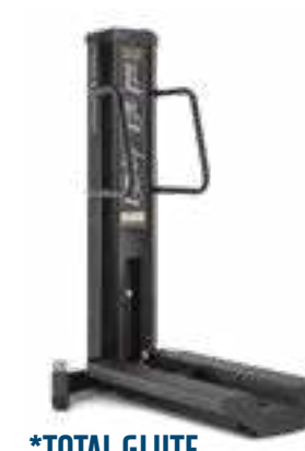
*TOTAL GLUTE HAMSTRING #G629

PRODUCT DIMENSIONS 75 x 47 x 74 in (190.5 x 119.4 x 187.9 cm) PRODUCT WEIGHT 150 lbs (68 kg)