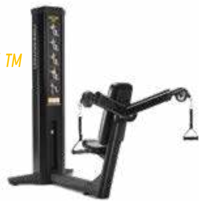
MULTI-PLANE CHEST #G600

LiveAxis™ pieces feature sliding pulley technology allows muscles to stay at optimum activation with constant resistance throughout the entire movement.