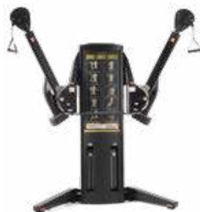
DUAL CABLE CROSS #G624

PRODUCT DIMENSIONS 35 x 43 x 91 in (89 x 109 x 231 cm) PRODUCT WEIGHT 430 lbs (195 kg)