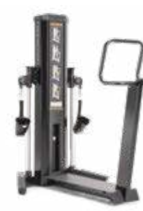
*TOTAL QUAD / HIP #G628

PRODUCT DIMENSIONS 46 x 64 x 74 in (116.84 x 162.56 x 187.9 cm) WEIGHT STACK 200 lbs (90 kg)