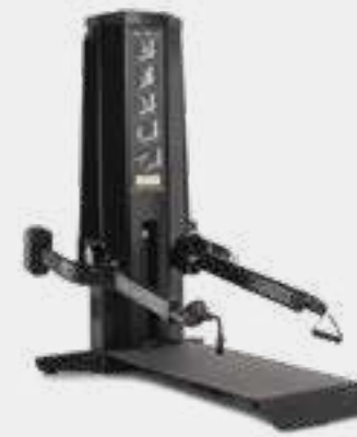
MULTI-PLANE LIFT #G612

PRODUCT DIMENSIONS 34 x 36 x 77 in (86.3 x 91.4 x 195.5 cm) WEIGHT STACK 150 lbs (68 kg)