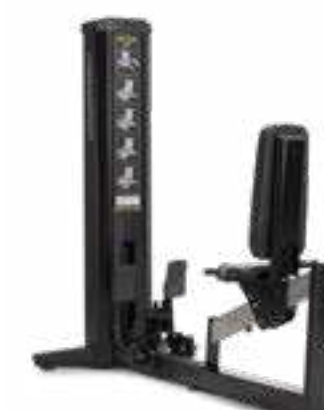
MULTI-PLANE CALF #G607

PRODUCT DIMENSIONS 56 x 36 x 77 in (142.4 x 91.4 x 195.5 cm) WEIGHT STACK 200 lbs (90 kg)