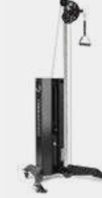
CABLE COLUMN #G625

PRODUCT DIMENSIONS 56 x 52 x 87 in (142.2 x 132 x 220.9 cm) WEIGHT STACK 200 lbs (90 kg)