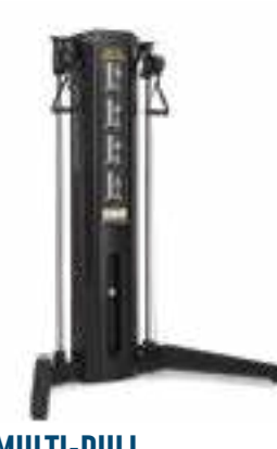
*MULTI-PULL ROTATION HIGH #G627

PRODUCT DIMENSIONS 46 x 64 x 74 (116.84 x 162.56 x 187.9 cm) WEIGHT STACK 200 lbs (90 kg)